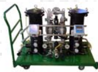
2-STAGE FLUSHING CARTS