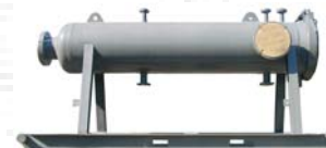
HIGH FLOW/HIGH PRESSURE VESSELS IDEAL FOR PIGGING