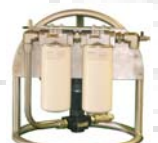
DRUM TOP UNITS

Precision Filtration Products · P.O. Box 218 Pennsburg, PA 18073